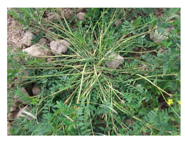
Variation in stem color

These examples demonstrate the varying growth habits and stem colours of different accessions of Sainfoin.