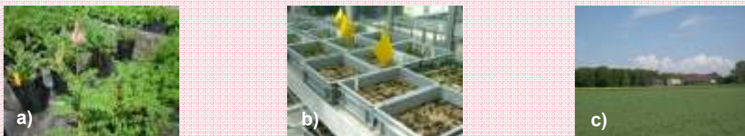
Fig.1 a) Maternal plants b) Young seedlings of the F1 mapping families c) Field site at Delley seeds and plants Ltd

Seed from four reciprocal pairwise crosses of single plants from O. viciifolia varieties was obtained and germinated in the greenhouse at ART. The resulting F1 populations will be planted in the field and will serve for phenotyping after an adaption period.